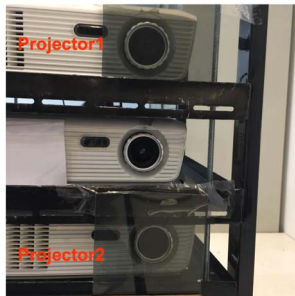
Fig.3. The projectors and their polarization filters.

anything, it just a dark screen. By using our algorithm, no matter how to place this screen in the space, the camera can detect and recognize this screen timely and synchronously. Finally, the reporter can decide to show authorized audience private content with Spatial Psychovisual Modulation (SPVM). Note that to maintain the polarization direction of the reflection light, the metallic screen is required.